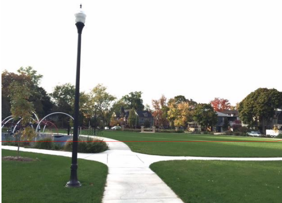
The Association and South Hill were recognized for building Pleasant Park at the May 2016 Historic Preservation Awards Ceremony. Huge applause to the Friends of GR Parks and the City of Grand Rapids for making it happen.

Social Events: The Association hosts two annual neighborhood wide events to bring neighbors together to community table. The Neighborhood-Wide Night Out is August; the Holiday Potluck and Annual Meeting is December. The Association also invites neighbors to hold