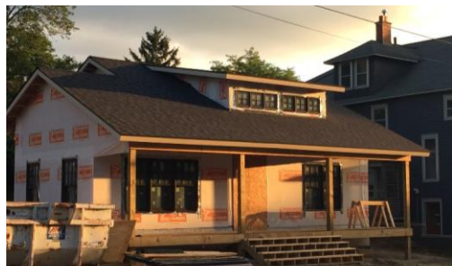
A new house grows on Pleasant SE – Welcome!

Apartment and Homes Listing Service: Due to our large rental community , the Association produces and publishes a list of available apartments in Heritage Hill whose landlords choose to list with us. It is an extremely popular service and Heritage Hill apartments are in demand. Our list is free to tenants and available on our Web site ( www.heritagehillweb.org ) and at the HHA office. To list an apartment, landlords pay a fee: $45 for a studio apartment; $50 for a one-bedroom; $55 for a two-bedroom and $60 for 3 or more bedrooms. The listing is for 2 months or until the apartment is rented, whichever comes first. The list also includes Homes for Sale in Heritage Hill. For Sale listings cost $100 and run