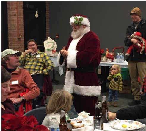
Rapids Historic Preservation Commission approved the

of the first floor. Many neighbor meetings were convened to address all aspects of plans for a restaurant, tasting room and other retail establishments as well as outdoor seating areas. An initial request before the City's Planning Commission was rejected due the non-specific nature of the request. Plans are currently on hold until a prospective tenant can be found. Neighbors meetings will resume once a specific request is proposed.